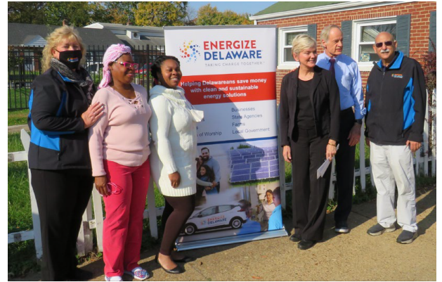
U.S. Secretary of Energy Jennifer Granholm Energize Delaware Event

The HEC 2 program proactively brings energy education to communities to reach customers that may not have been served by a more traditional community-centered approach. Franklin Energy provides income-eligible participants with an in-home energy education visit that includes an informational walk-through energy assessment. Participants receive a report with information about energy-related programs for repairs, rebates, and utility assistance. Customers also receive no-cost direct installation of LED light bulbs, faucet aerators, showerheads, and other water-saving measures.